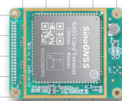
50*40mm (pin to pin with K705)